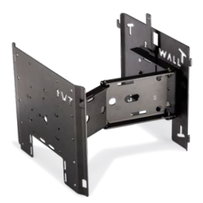
Slim Mount 290