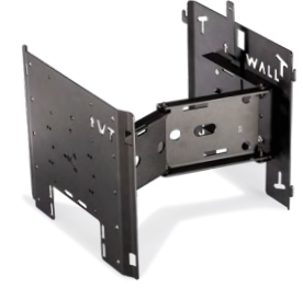
Slim Mount 290 ROTATION