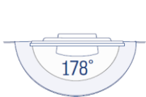
Wide-angle panels of the highest quality