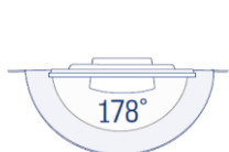
Wide-angle panels of the highest quality